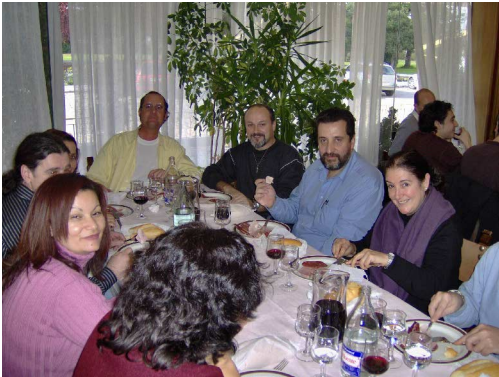
Enjoying a meal together