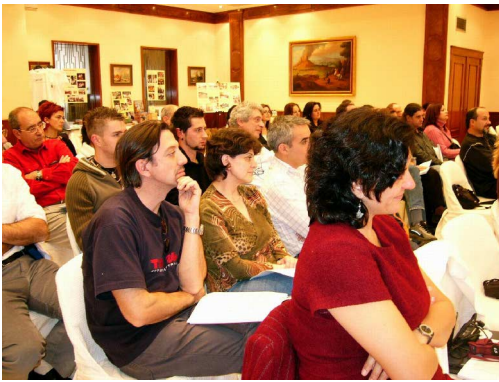
Focused attendees during class