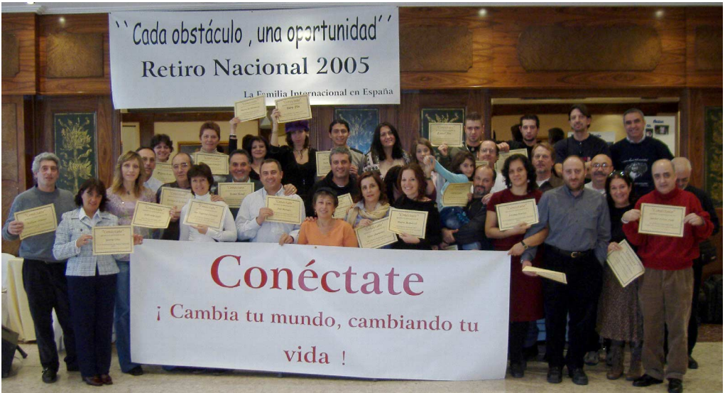
Group remembrance photo