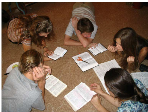
One of our youth Bible studies