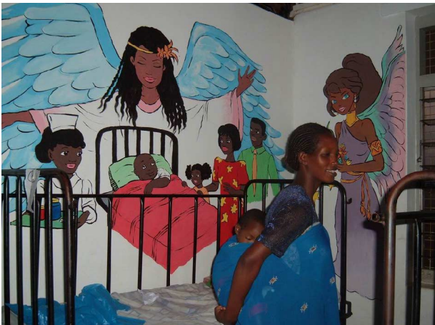
Mother and child patient in front one of the murals

I offered him one part of the wall that needed to be painted—the angel’s wing. It was very large, taking up almost half of the entire wall. He was more than happy to put his artistic talent to that, and it came out very well. Later on, we prayed for his little daughter and the continued recovery of her tiny body.