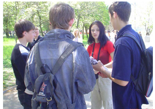
Witnessing at a music festival

I believe that in Heaven each of us who've won souls will be swimming in notes such as these, which give such a warm feeling of fulfillment and happiness, knowing that we took that extra step for the Lord, did what was difficult for us, loved that lost soul, went out witnessing that day when it was freezing cold, rainy, or torridly hot, made that phone call when we didn't feel like it, stepped out of our pride to witness to that good-looking guy or girl we were feeling too shy to approach, or pulled out the guitar to sing for someone even though it was uncomfortable to sing to a complete stranger, or got up in front of a crowd of university students when we'd never had a knack for public speaking ... and the list goes on.