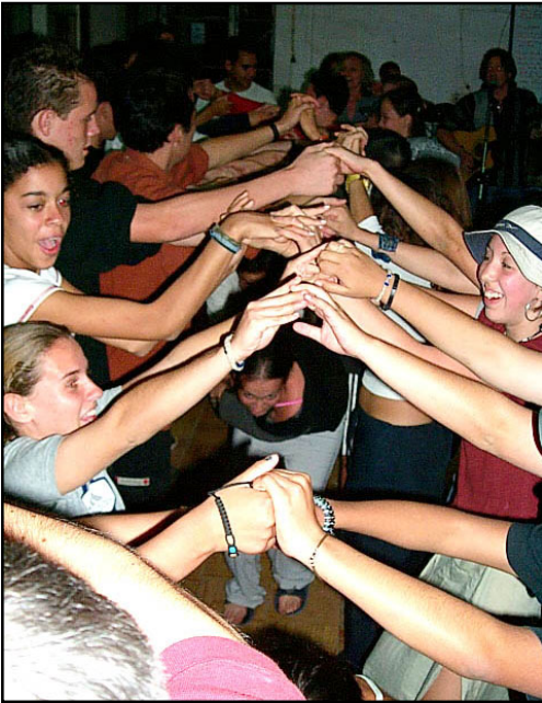
Central America: No camp is complete without some good old get-out-of-yourself gypsy dancing.

In October a two-day fellowship was held for all the JETTs and junior teens in the Mexico City area. This fellowship included a rock 'm sock 'm morning inspiration, a three-hour class on our role during the Endtime (using the movie The Matrix as a springboard), fun volleyball tournaments, a hotdog roast, true-to-life stories, and gypsy dancing around a campfire, and overnight camping in tents.