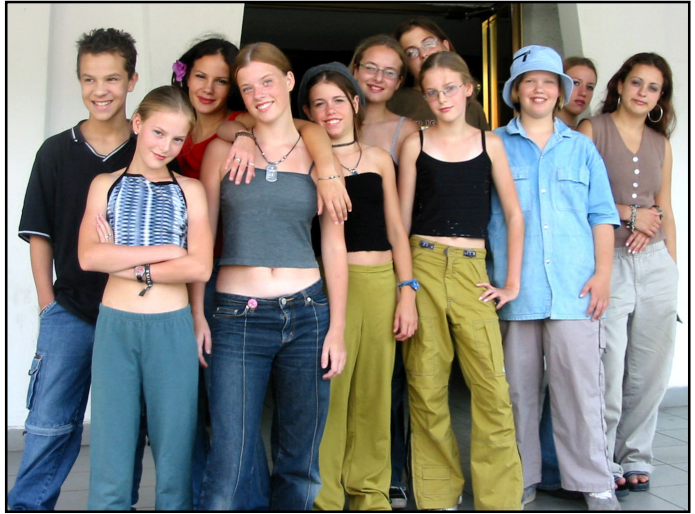
Bottom: B2B JETT/teen camp