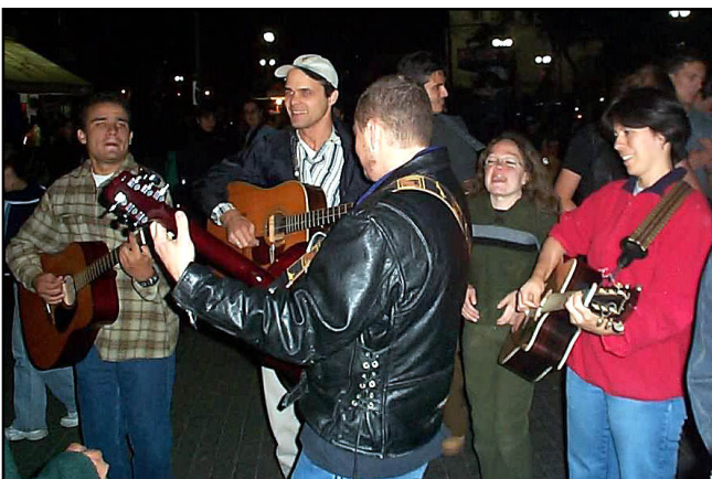
Street witnessing in Mexico City

It was wonderful to see the fruit of working together as an area, FGAs with SGAs and foreigners with nationals on this united area project.