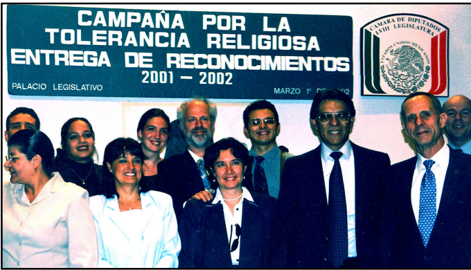
Mexican PR team at congressional event