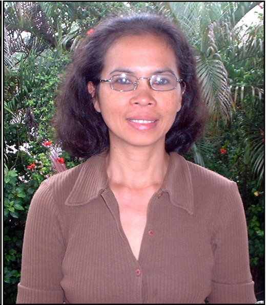
Philippine/Indonesia VS board: