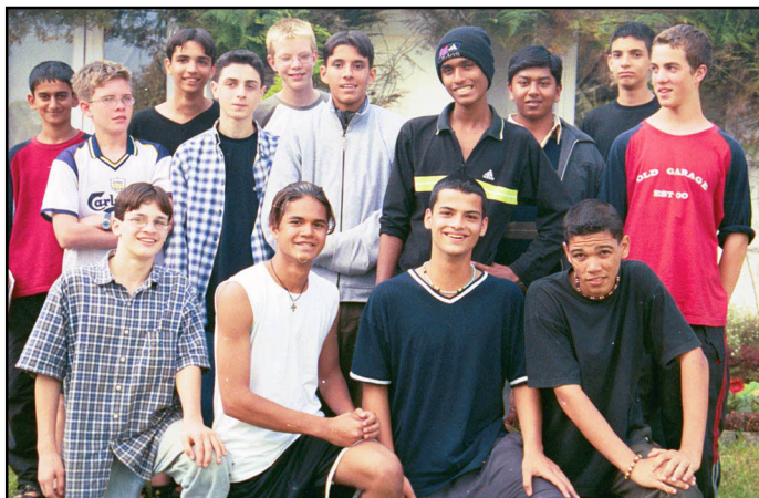
JETT/teen boys in South India