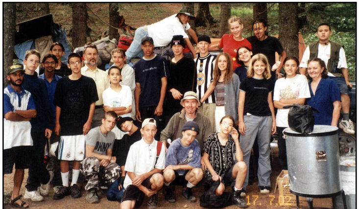
Pakistan teens at their base camp before trekking in Northern Pakistan

The major thrust at present for the national boards is to develop ways to provide