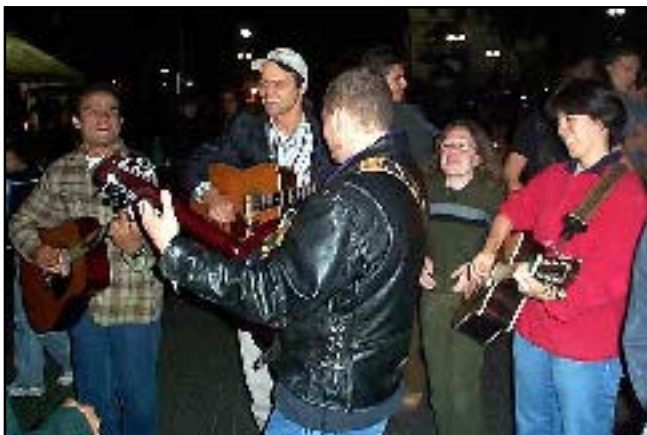
Street witnessing in Mexico City

It was wonderful to see the fruit of working together as an area, FGAs with SGAs and foreigners with nationals on this united area project.