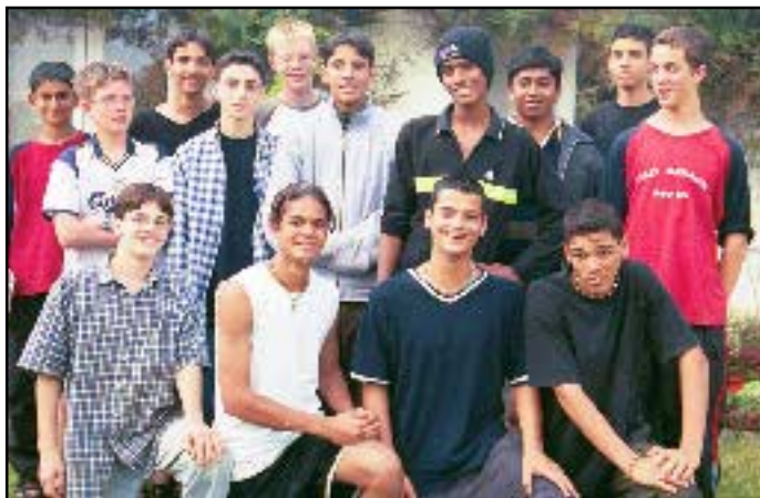
JETT/teen boys in South India