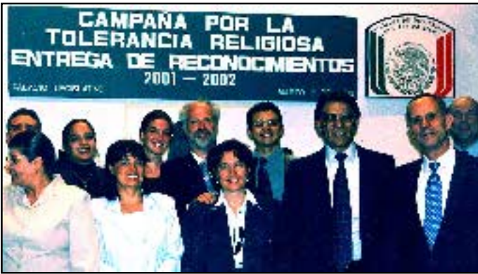
Mexican PR team at congressional event