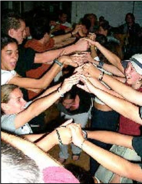
Central America: No camp is complete without some good old get-out-of-yourself gypsy dancing.

In October a two-day fellowship was held for all the JETTs and junior teens in the Mexico City area. This fellowship included a rock 'm sock 'm morning inspiration, a three-hour class on our role during the Endtime (using the movie The Matrix as a springboard), fun volleyball tournaments, a hotdog roast, true-to-life stories, and gypsy dancing around a campfire, and overnight camping in tents.