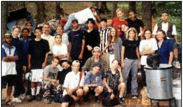
Pakistan teens at their base camp before trekking in Northern Pakistan

The major thrust at present for the national boards is to develop ways to provide