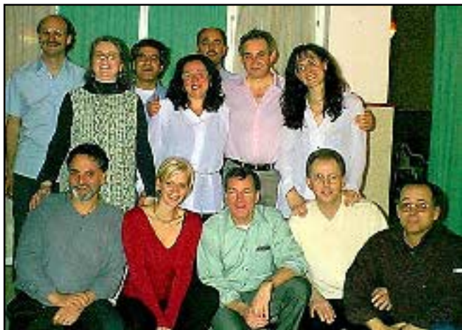
Western Europe CGO board members

▪ Witnessing activities for youth: We organized some summer activities to inspire our young people and help them catch the vision for witnessing. A team of on-fire young “professionals” from Angela’s Home went down to Greece and took some of the local young people out on witnessing attacks. Some