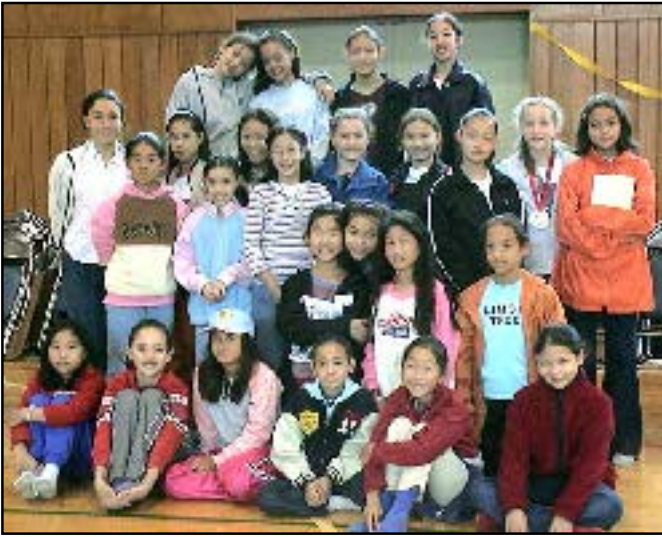
The girls at the East Japan Autumn OC Camp 2002

and easy to digest. We sent the Homes a Word study for the OCs, to follow up on the classes they had at the camp.