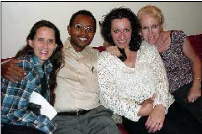
Top: East African FED board Middle: South African FED board Bottom: West African FED board