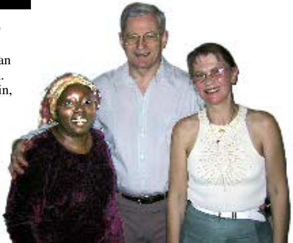
Western Europe: Northern FED board

We’ve worked on setting up resource libraries on a national level.