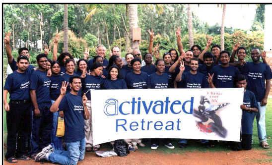
Activated retreat in Bangalore

The south CGO board produced a variety of feeding materials for Homes in an easily accessible format. These include: 12 Foundation Stones in GN-size booklets; Wine Press and New Wine , spiral bound as a set of four books; Activated mags 1–15, spiral bound with class sheet attached (now available to the Homes worldwide from the Europe Activated desk); songbooks for COLS; eight Bible classes and seminars given by experts in their field, on VCD; six b/w tracts printed for the Homes to order.