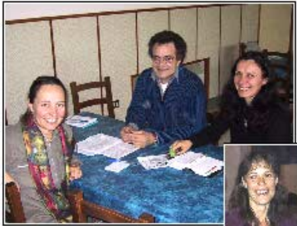
Western Europe: Southern FED board

Meekness (in the north) managed to find some great discounts and cheaper contacts for obtaining books, and the Lord has also been supplying material at book fairs.