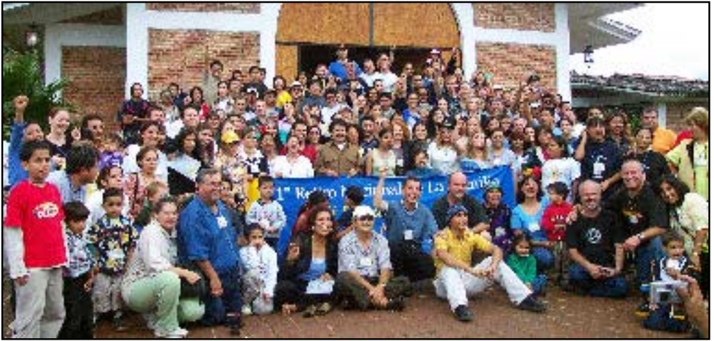
Mexican national retreat

retreat for our sheep, Activated members, and other friends and contacts. Initially we only planned the retreat for the Homes and sheep in Southern Mexico. The hotel facility that we rented had a maximum capacity of 300 persons. We weren't sure if we'd receive enough registrations to fill the facility or to even cover the cost of the hotel. Well, we should have had more faith, because the response was overwhelming! The Lord fulfilled prophecy and we were literally "not able to contain." In fact, we had to ask some of the CM Family not to attend this time in order to make room for sheep and friends. Our dear CM brethren graciously gave up their places. Next time we'll get a larger facility or perhaps have more retreats.