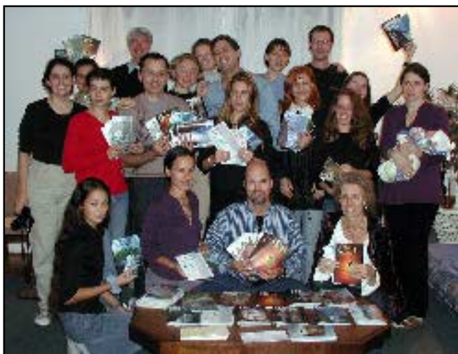
Budapest Activated meeting in September 2002