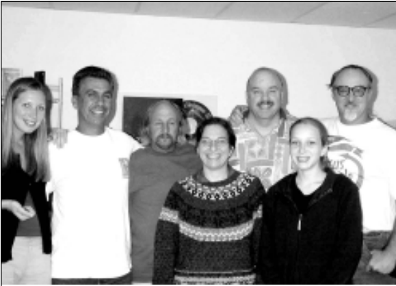
Bible study group in Los Angeles, California