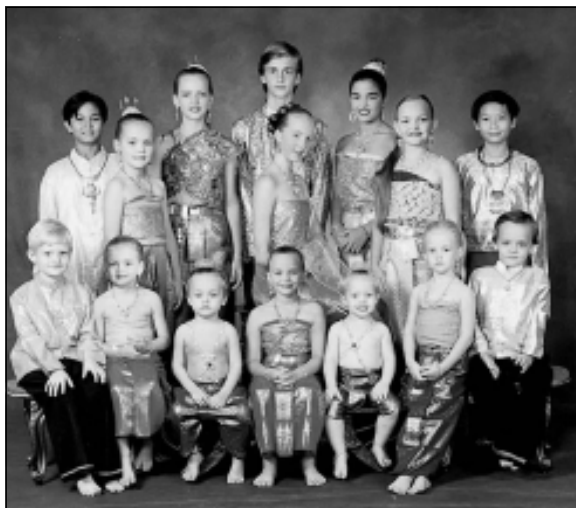
Children in traditional costume at the DF Home, Thailand

117. Please pray for protection and supply for our Family in Pakistan, and against the tightening visa situation. Despite the present difficult and sensitive circumstances, our Family members there have decided to stay on their field to minister to their precious friends and contacts, who look to them for support and comfort now more than ever.