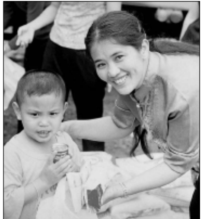
Love distributes food, Thailand