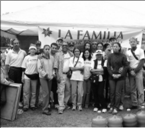
Cush and Zara's Home CTP, Guadalajara, Mexico