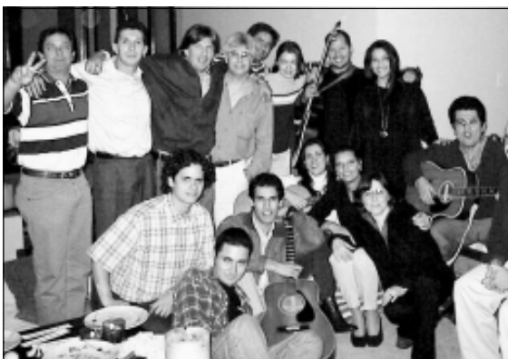
Bible class group, Lima, Peru

56. We were pleased to see that we could get in quite a bit of witnessing in our seminar presentations, and we included lots from the Letters in a 20-hour series consisting of four seminars focusing on moral values and human relationships. We were able to follow up on several of the attendees, invite some outstanding sheep to our Bible classes, and get some of them activated as well. These seminars were held for all the personnel of a very prestigious businessmen’s club, and for an important airline. We have several open doors in this area for the coming year.