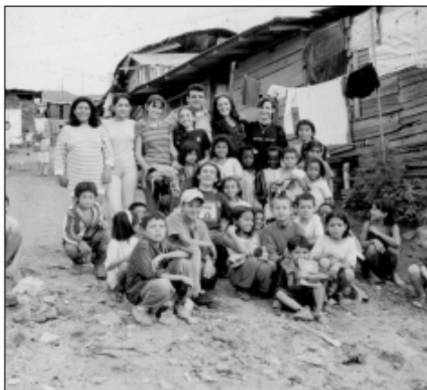
Witnessing at a poor neighborhood of war refugees on the outskirts of Medellín, Colombia