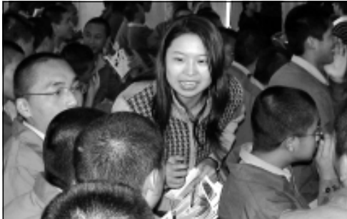
One of the young people from the Taichung Homes with the inmates at a delinquent center where the Family performed