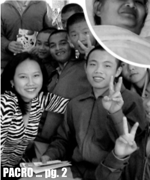
PACRO ... pg. 2