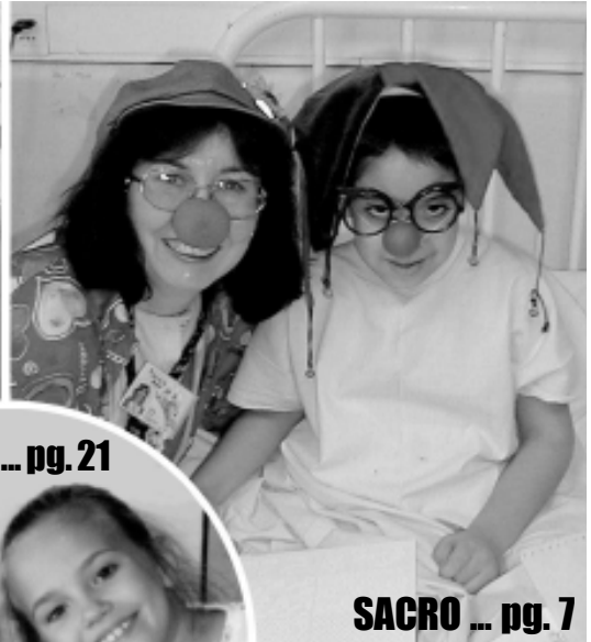
SACRO ... pg. 7