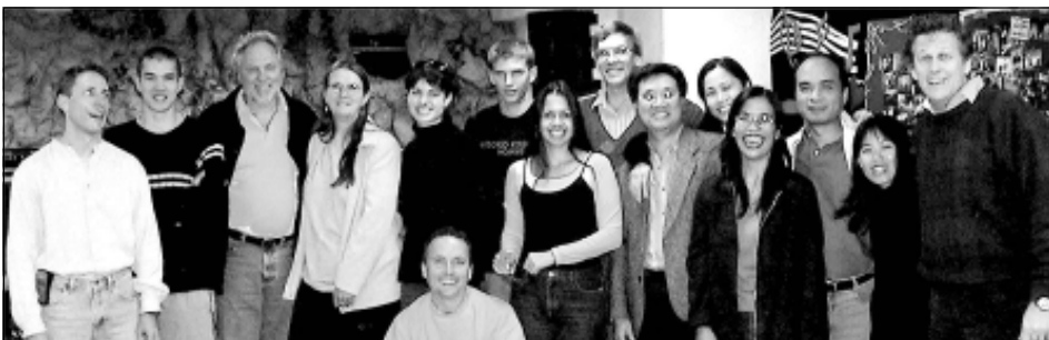
Attendees of the Taiwan witnessing delegates meeting in November 2001