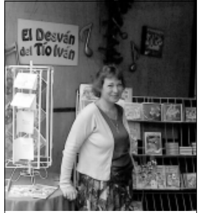
The Lord opened a door for us to set up a booth at the "Feria del Libro" (biggest book fair in Lima), which ended up being a terrific witness and tool outlet. Peru