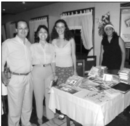
Contato's Desk (Activated) present at benefit dinners, Brazil