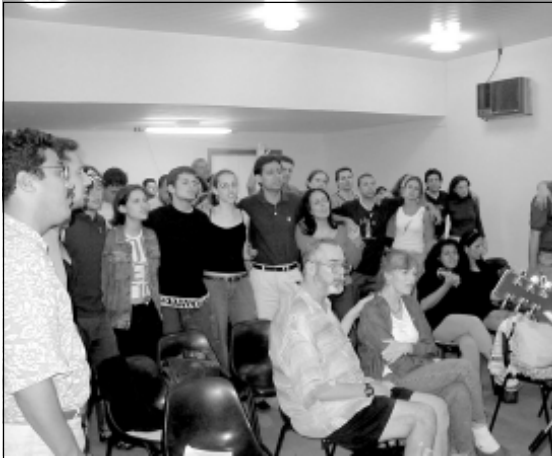
Praising the Lord in song together, always a highlight at Activated meetings, Brazil