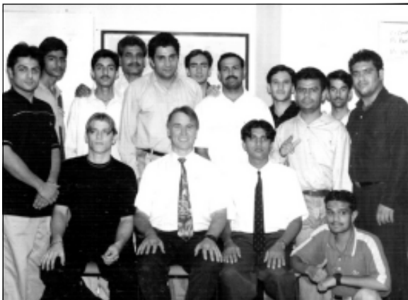
Family in Lahore working with the deaf at their newly opened center called "Deaf Reach"

115. Additionally, each Home has a performing show group. Music is a real key to the Pakistani heart. At this time of western negativism regarding the Muslim world, when the people see foreigners singing to them in their local language it is a way to build bridges instead of walls. Recently Heartbeat , the Karachi Home's show group, appeared on international cable TV in a special Eid show broadcast from London to over 75 countries