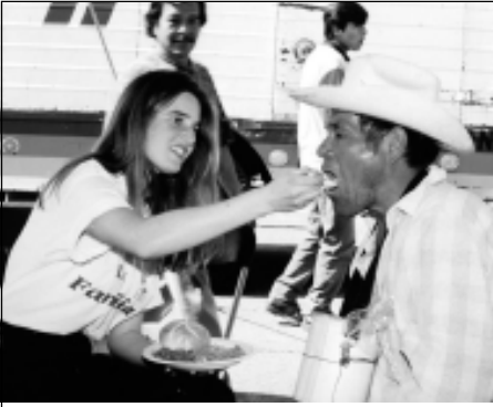
Robin feeds a man with no arms, Zocalo CTP, Mexico