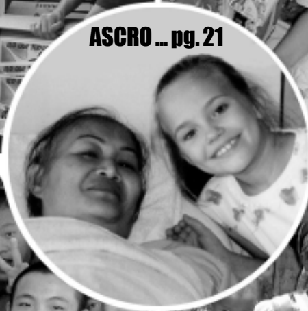
ASCRO ... pg. 21