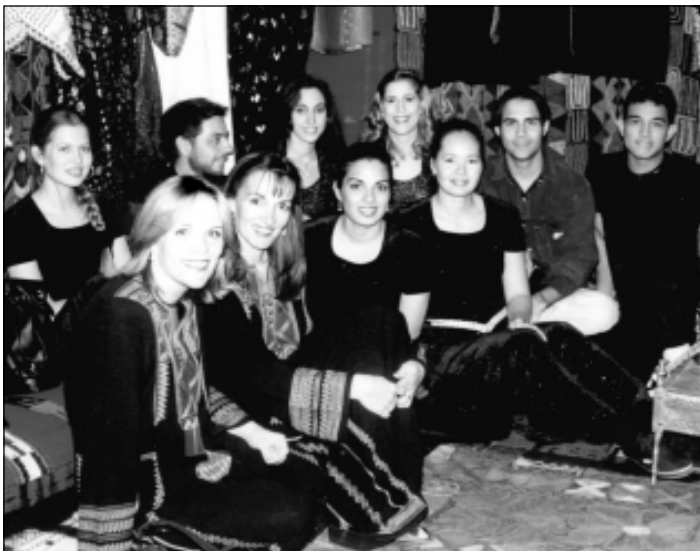
Heart to Heart singing team, Mideast

(These figures are based on a survey that we had sent out, to which most of the Homes responded.)