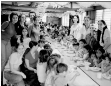
Witnessing after Christmas concert at a day care center for kids affected by the violence of the country, Medellín, Colombia