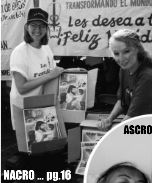
NACRO ... pg.16