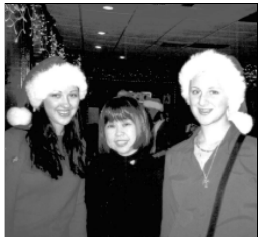
Restaurant singing, Los Angeles, California

67. In California a “Teen Club” has sprung up, which is a committee of older SGAs in the local area working together to meet some of the needs of the teens of the area, such as their need for fellowship, etc. For the past six months they’ve been meeting weekly for activities such as united get-outs, Word classes, birthday parties, dances, camping trips, witnessing trips to Mexico, as well as a three-day camp to read the new “Conviction vs. Compromise” series.