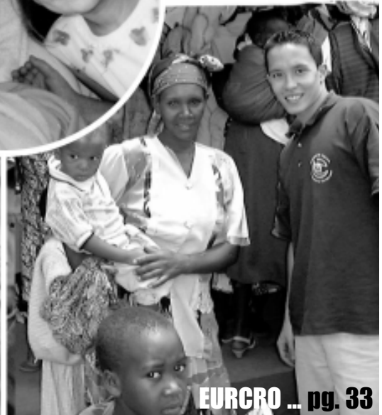
EURCRO ... pg. 33