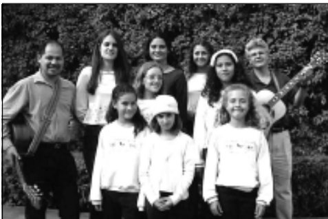
Kids busking team performing at CityBank agency where one of our live-outs is employed. Everybody in the office got saved! Lima, Peru