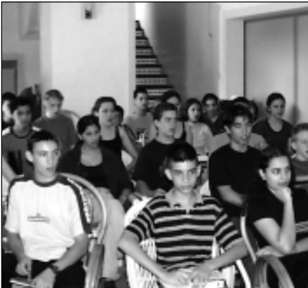
Youth Camp Word class, India