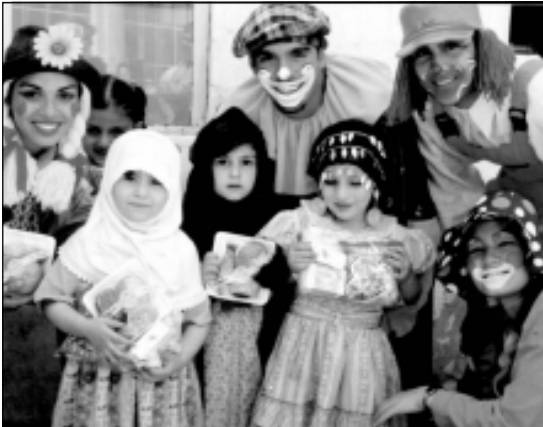
Our clown team brings a little bit of happiness to some children, Mideast