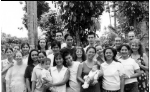
Attendees at a recent childcare seminar, Philippines