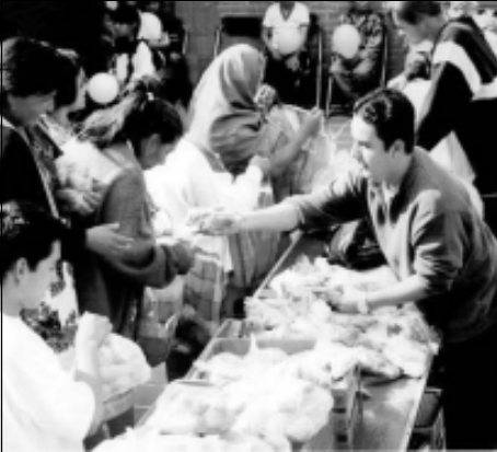
Distributing food packages to the needy, Morelia, Mexico