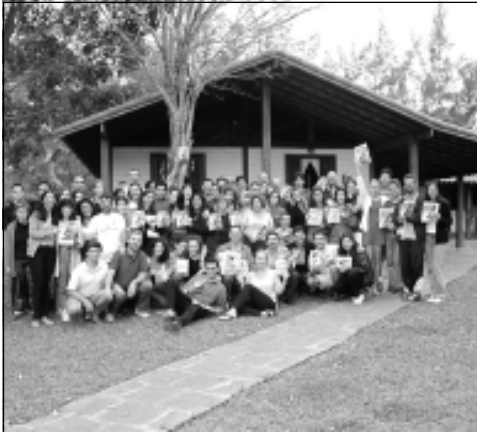
Everybody lifting the Contato ( Activated Brazil) "banner," Brazil