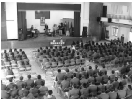
Taichung Homes performing at a prison