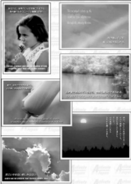
Quotes postcards—new Japanese tools