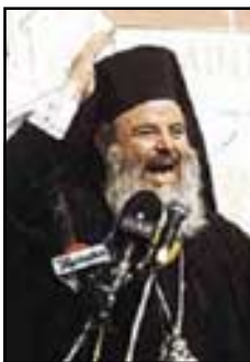
Greek Archbishop Christodoulos

33. About 97 percent of Greece's native-born population is baptized into the Orthodox Church, which sees itself as the true guardian of Greek identity. Many church leaders are deeply suspicious of the government's move. They see it as a threat to the Christian Orthodox character of the nation and possibly the stirrings of an eventual separation of church and state in Greece.