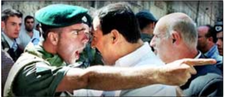
An Israeli policeman and a Palestinian scream at each other

5. In some of these messages, the Lord and Dad not only provide insight into current events but also pass on some related prayer requests. So we pray as you read these prophecies which follow, you'll not only be informed but stirred to prayer . Your prayers do make a difference! Thanks for praying! God bless you!