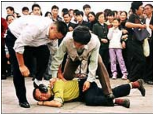
Falun Gong protester in Tiananmen Square being restrained by Chinese security forces

53. In the case of the Chinese who worship after the manner of Falun Gong, their conviction is also inspired by the fact that their previous beliefs have failed them. They were told that all forms of religious belief were