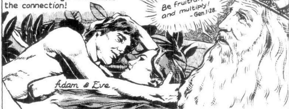
Adam & Eve

—There has to be communication ! If your communication with God is good, you will have excellent communication with your husband , because God is the central Exchange that makes the connection!