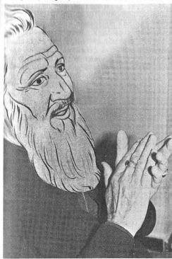
Dad leads the family in singing, PTL!