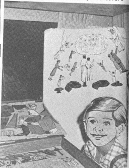
Let's have a flannelgraph!

36. NEVER UNDERESTIMATE THE BLESSING & TEACHING TOOL THAT FLANNELGRAPHS OFFER! You can do so much with so little, even xeroxing as we have, from the MO Letters & TK's good illustrations to use on the flannelgraph board to portray your Bible teaching theme! Perhaps the greatest help in using flannelgraphs for teaching is not necessarily having a great selection of figures, but how you organise & file your figures to get full use out of what you have! In Mag-size envelopes, separate your figures into groups such as Men; Women; Children; Jesus & angels; Outdoor scenery; Indoor scenery; Sky & stars; Animals; etc., then further categorise into Old Testament & New Testament stories. If a tan flannel piece covers