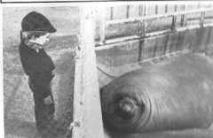
Wow! What a whopper of a walrus!

a spectacular water show with dolphins and whales! We also visited an International Trade Fair where after viewing all the many types of lawnmowers, big caravans, tractors & other machinery there, to David's delight, we spotted a very sturdy little motorcycle-type tri-cycle on display & bargained with the man to buy it for a very low price. We called in to tell Mommy & Daddy about it, he answered "Well, for that cheap a price you ought to buy two of them!" Ha! Only one was for sale though, & David was thrilled with it. It was so darling to see him jump on that little tri-cycle & drive it right down the lane through the