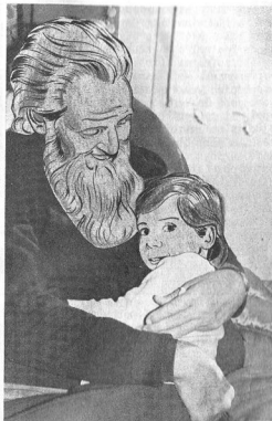
Remember, Love Never Fails!

7. MANY OTHERS OF OUR FAMILY PARENTS HAVE REPORTED SIMILAR PROBLEMS IN THEIR 4'S YEAR OLD CHILDREN OF A RECURRENCE OF NIGHT-TIME BEDWETTING, oddly enough of children who have been previously thoroughly potty-trained but then suddenly relapse into a bedwetting problem. Perhaps this has occurred when "mommy's new baby" was due to arrive, accompanying a common problem many children encounter