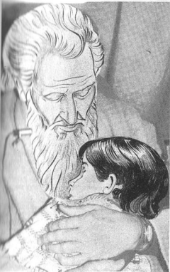
The effectual fervent prayer of a righteous man availeth much! Ja.5:16.