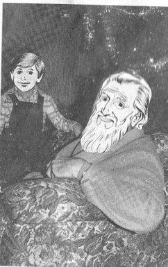
The King & Prince at NYE Praise Meeting!