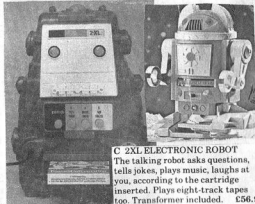
C 2XL ELECTRONIC ROBOT The talking robot asks questions, tells jokes, plays music, laughs at you, according to the cartridge inserted. Plays eight-track tapes too. Transformer included. £56.95