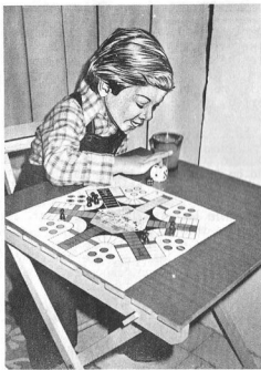
Adding together 2 dice in freeplay boardgame!--You can make your own!