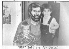
"RNR" Soldiers for Jesus!