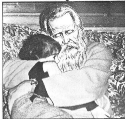
His father's beloved!