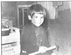
He's a "handy" man to help out at home!