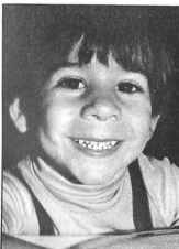
Daddy says I look like a chimp.