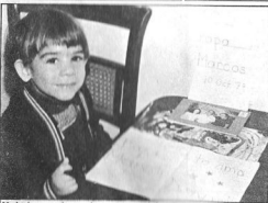
Writing a love letter to his Spanish grandpa!