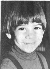
A sweet smile, with love!