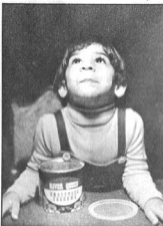
Reading & snacktime w. Mommy.