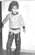
This costume was his own idea, but he was afraid of the night, ha!