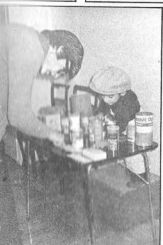
Dave wants lower prices!