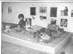
Basement w. landscaped town & number posters.