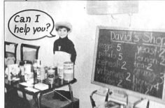
Can I help you?