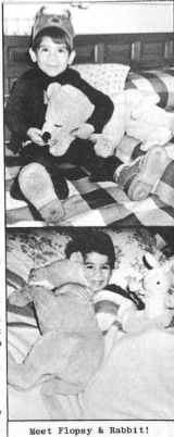
Meet Flopsy & Rabbit!