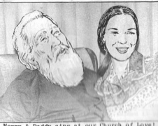
Mommy & Daddy sing at our Church of Love!