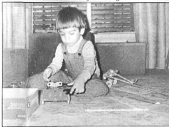
The wooden "Brio" brand construction set.

SPEED LIMIT SIGNS, etc. I have tipped him small coins for doing small favours for me, such as carrying groceries or emptying the trash, etc. He likes to save his money & use it on something worthwhile, such as a well-made car or the little farm set he just bought.