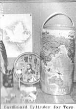
Cardboard Cylinder for Toys

WITH NATHAN ON READING. For example, he liked decorating round cardboard cylinders with shapes which he traced & cut out of construction paper, added the YOUNG MAN'S covered the cylinder with clear contact