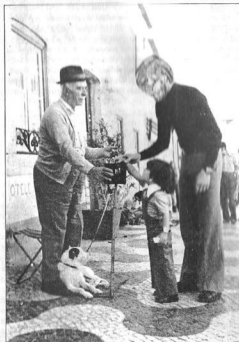
A love gift for the blindman--Cascais, Portugal

--A safe place to call "home"--at least for a little while!--We're indeed pilgrims!--He.11:13.