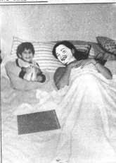
A place "to lay our heads"-- Madrid home.