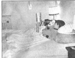
Be sure to teach the children to always read in very good light!

6. HE CAN DRESS & UNDRESS HIMSELF VERY WELL, except for putting on his own socks successfully, tying his shoes & pulling turtle-neck shirts over his head, which is difficult. He likes to button up our big people clothes & insert a hanger into the shirts, etc., as they are laid out on the bed. He has just learned how to successfully unbuckle his own sandals, put them on & sometimes buckle them back. He is also learning to put on his own watch, which is a one-handed job. PTL!