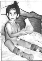
"What do you do after your baths?"