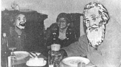
Happy Time at Dinner with Mommy & Daddy!

23. OUR SWEET HAPPY MAIDS CONTINUED WORKING WITH US FOR A COUPLE OF MONTHS until they eventually had to quit when the daughter, about 22 years old, had to have a hospital operation that