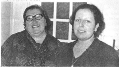
Our Portuguese maids.