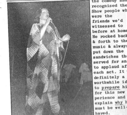
5. AFTER THE SHOW,