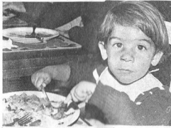
Eating with knife & fork!

22. IT'S QUITE STRANGE TO SEE CHILDREN IN MANY COUNTRIES ON THE STREETS IN BABY PRAMS WITH PACIFIERS IN THEIR MOUTHS who are the same age as our Family kids who are learning to read & write, etc.! The Lord has surely blessed us with exceptionally special children, do you believe that?