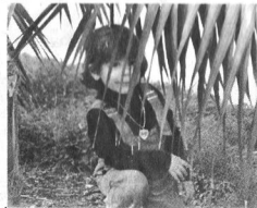
"Come find me, Mommy!"