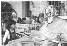
"Sorry, Daddy! I won't try to throw it any more!"