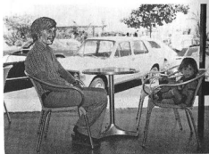
He orders "agua y pan", bread & water, when eating snack out.

35. IT'S EASY TO REVIEW NEW VOCABULARY WORDS in our discussions of daily events and when reading and talking through books together.