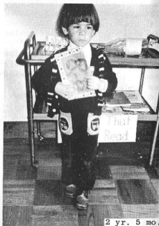
2 yr. 5 mo.