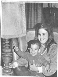
"A new trick!"--8½ months.

but don't you know that thing is expensive? It doesn't even belong to us! You 'hippies' have no respect of value! Can't you tell that's not a playing? He could break it!" We were so used to giving him household objects and keeping him interested in new things to play with that sometimes we even went overboard!