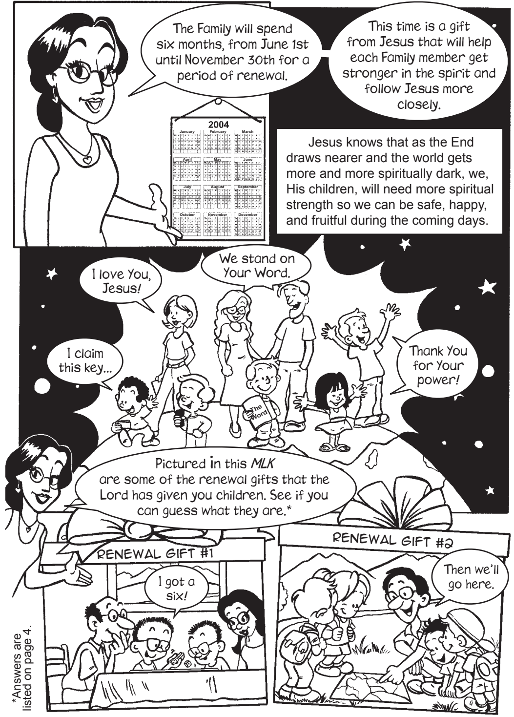
Copyright © 2004 by The Family. Art by Shae.