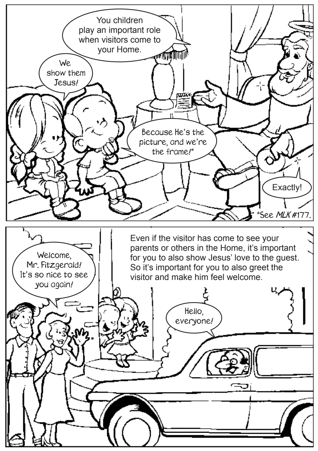
Copyright © 2003 by The Family. Art by Shae.