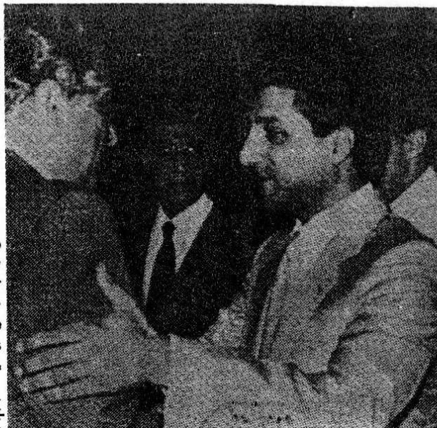
President-elect Bashir Gemayel, right, is congratulated by President Elias Sarkis

54. SO AS SOON AS ISRAEL IS SURE THAT ALL OPPOSITION IN BEIRUT IS ENDED & nothing in the way of any signifi-