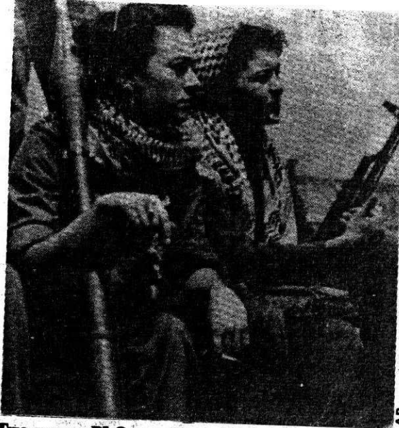
Two women PLO guerrillas, with their weapons, wait for evacuation to North Yemen.

ated, watch & see if the Jews then do not start a two-prong drive, to Tripoli & Bekaa, to make sure that none of those Palestinians get back into Northern Lebanon—which is the most logical thing for them to do!