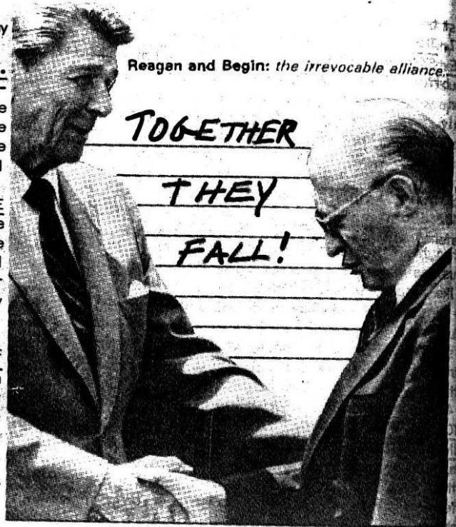
Reagan and Begin: the irrevocable alliance.

67. HERE'S THE SEACOAST WITH THE MAIN FOUR CITIES—