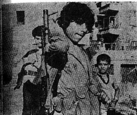
Teen-age Palestinian in southern Beirut suburb

years right to the End! Otherwise there wouldn't be anybody left to be raptured. If there weren't still some Christians around!—And who'd be the Endtime Witnesses?