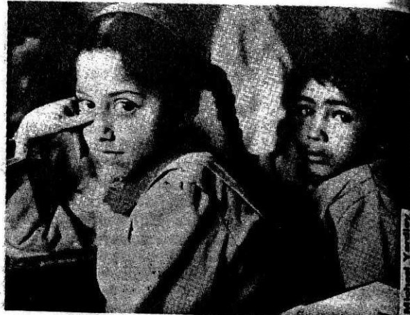
A Palestinian school outside Damascus,

119. I SAID, "WELL, THAT'S MY THEORY, THAT'S MY INTERPRETATION of what the Lord has shown me & what I read