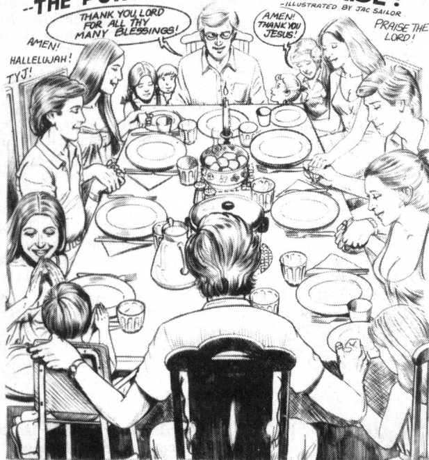
ILLUSTRATED BY JAC SAILOR THE POWER OF POSITIVE PRAISE IS TERRIFIC! COUNT YOUR BLESSINGS! THANK GOD FOR ALL HE HAS DONE & JUST CHASE THE DEVIL AWAY, ALL HIS SHADES OF NIGHT, BY LETTING THE LIGHT IN GOD'S POSITIVE LIGHT OF SCRIPTURE, THE WORD, PRAYER, PRAISE, SONGS, ANYTHING YOU CAN DO TO OCCUPY YOUR MIND COMPLETELY WITH SCRIPTURE, PRAYER, PRAISE, SONGS, POSITIVE THINKING OR WORK!—THE DEVIL HATES!!!—GOD LOVES!!!