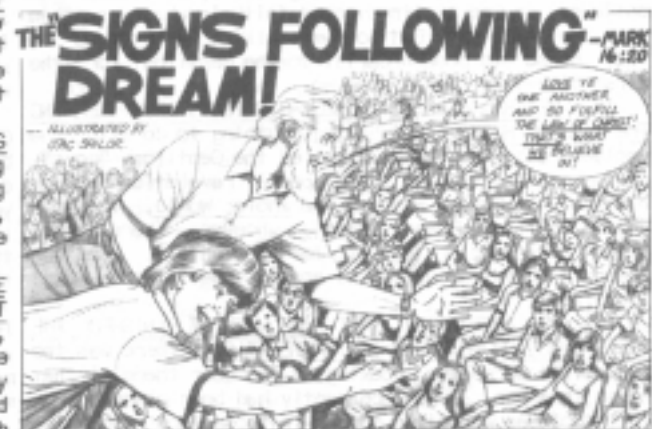
THE "SIGNS FOLLOWING" DREAM!

40. MAY GOD HELP YOU TO GET HALFWAY TO HEAVEN & RECEIVE HIS WORD YOURSELVES! Now that you're growing maturing Christians you don't have to always just receive it from me, you can get it directly from the Lord Himself by His spirits & angels, & grow to be a strong pastor or shepherd yourself to feed His sheep with the sincere milk & even the strong meat of the Word that He's now giving us & giving you & will give you in the future in the dark days ahead, in these last hours of the World's history when they will need it so much. May God bless & keep you drinking this Word from Heaven!