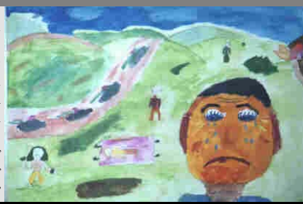
A picture of the Kosovo disaster as seen through the eyes of an Elementary school student here in Houston