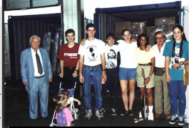
The FAP Team- at the 'send off' Press Conference

needs that we can't bear the thought of having to take on what we 'perceive' as someone else's burden, especially when it is 'on the other side of the world'.