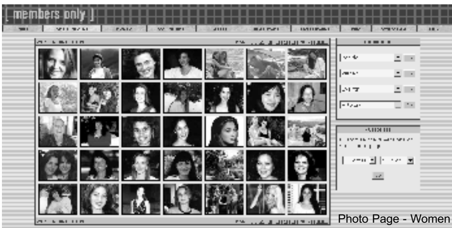
Photo Page - Women

We love you and look forward to hearing from you soon! We hope that you'll enjoy the new site and that it's a blessing to you.