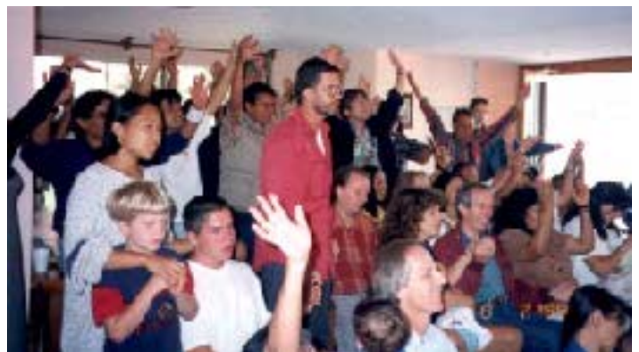
Making a joyful noise unto the Lord our Mexico Workshop '99 attendees rock the house during inspiration!

The Lord also emphasized the importance of our adult parents getting their needed get-outs and vigorous exercise; many have reported health problems, which can be traced to lack of sufficient exercise. Don't miss your get-out!!! One discussion focused on nutrition, and our need for healthier eating habits.