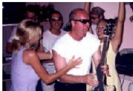
Here one of the CROs here in Mexico is caught red handed (we won't mention names to protect the guilty) doing a little 50's Rock 'n' Roll spot at the Mexico Workshops '99 farewell dance.