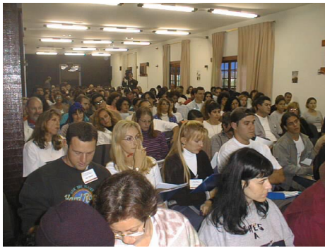
A retreat class