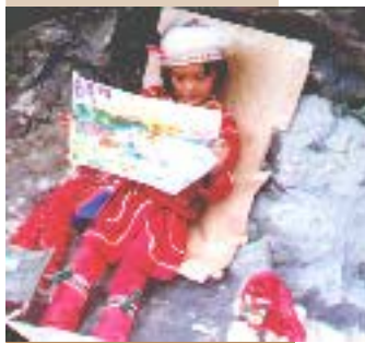
YOUNG AMI TRIBE GIRL WITH A POSTER