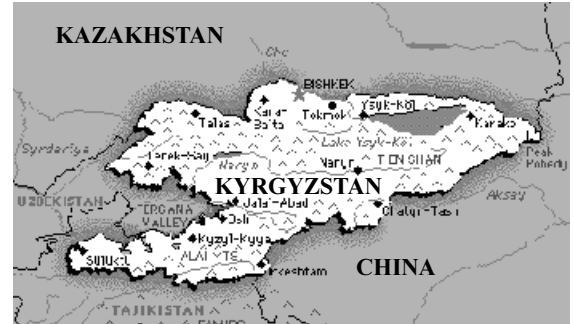
Kyrgyzstan (officially Kyrgyz Republic), independent republic in Central Asia, formerly part of the USSR with a population of 4,421,000 (1991). The area is almost completely mountainous and subject to major earthquakes. Bishkek is the capital and largest city.

After a four-hour bus ride, we arrived in the capital of Kirghizia, which looks more like a big village—very quiet, with hardly any cars. Many Russians still live there. We quickly distributed all the lit we had brought with us, as people were receptive and happy to receive it. After much searching, we met with a scientist who had written in and begged us to stay with him in his village for our last three days. A friend of one of his relatives had gotten one of our posters in Moscow years ago and that's how he first got in touch with us! We were able to read the Word with him and minister to his brother and other family members. We're planning to return here on a regular basis.