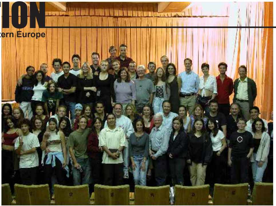
Attendees at the Romanian seminar

This seminar was attended by a lot of junior and senior teens, YAs, SGAs, nationals, and some FGAs. The Lord punched through, and brought to life