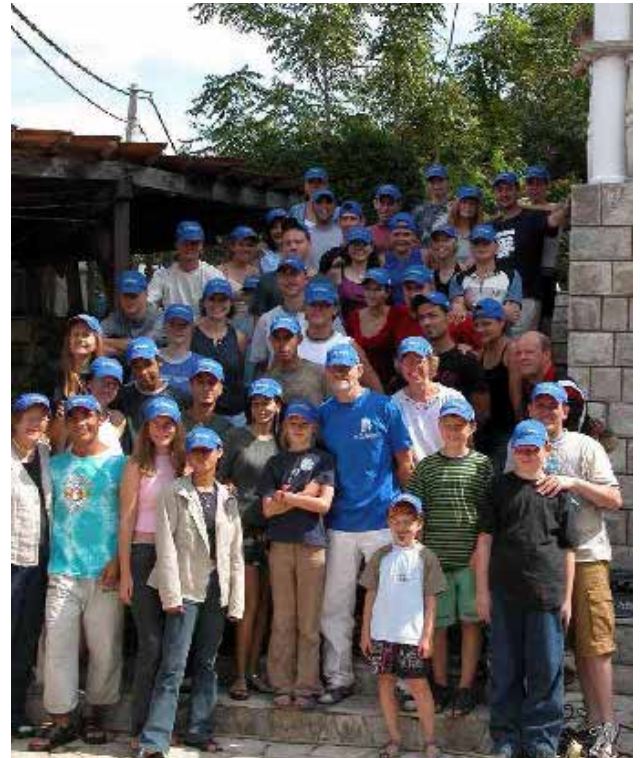
The entire group on the steps of our guesthouse