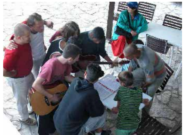
Taking advantage of a free moment to sing some songs that made the Revolution