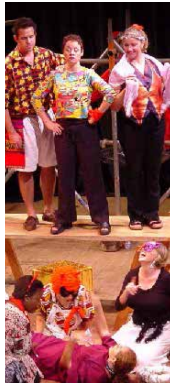
Story of Lazarus

After the play we had Caddy Awards, which is a bit of a joke, but it’s where the director gives a meaningful item to each of the cast for their efforts in the play. For example, a lady who played “Herb”