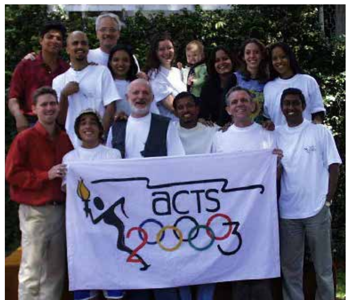
The JT board members

A new strategy was used during these training days, known as "A hands-on, physical application," in relation to the different tactics talked about. The main thrust of this strategy was activated through workshops. A team of lieutenants and sergeants were brought in, who specialized