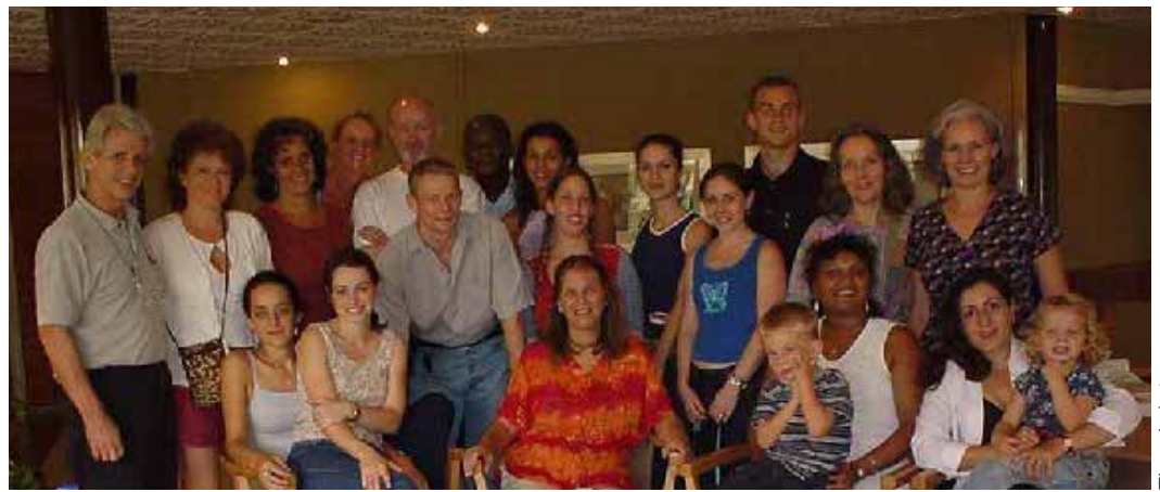
The whole team

The scheduling of the meetings was an intricate piece of work, as many board members are on several boards, including Lisa who is the regional chairperson of both CP and VS boards. After having our initial meeting on the first morning we all split up for individual meetings within our respective boards. Amber gave us all