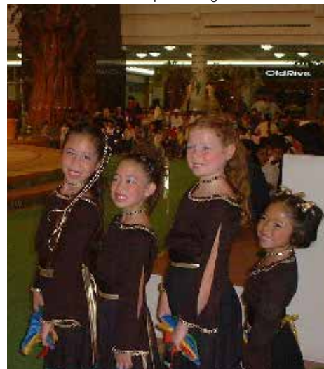
Girls performing for a live TV show

So who says you can't have an exciting life for the Lord when you have small children! What is that in your hand?