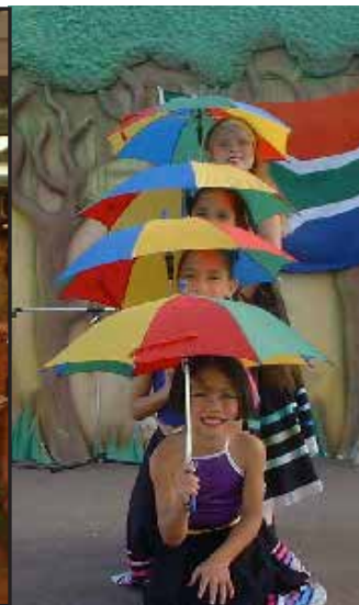
Performing the rain song in Arabic