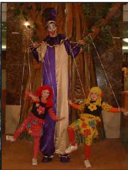
Puppets on a string for live TV show