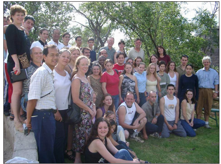
A group shot

Recently WS income has not been able to cover all of WS outgoing gifts and expenses, so we've sent out the below notice to all WS gift recipients worldwide notifying them of a possible/probable cut in WS budgets starting next month, May. This will likely mean a cut in WS services to you, dear Family, because our WS units and Family production centers will have to live within their reduced budgets. We'd like to ask any of you who come upon