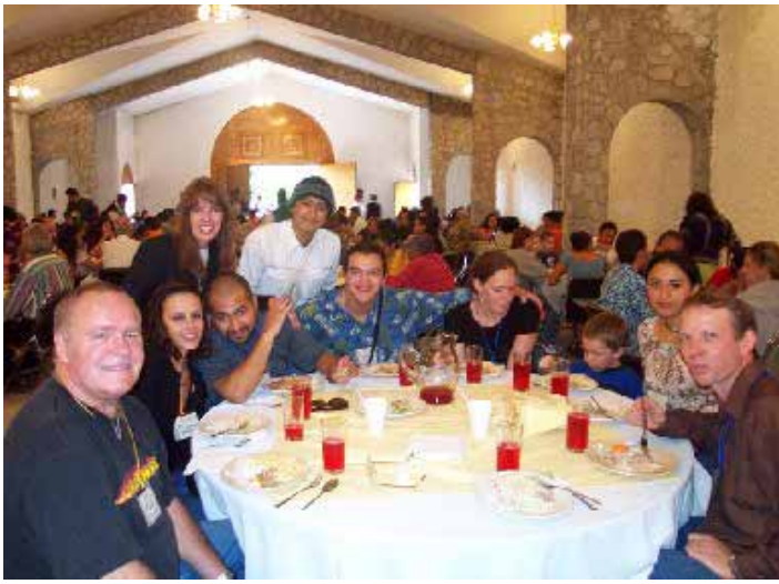
A shot of the dining room