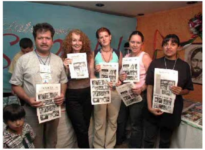
Attendees holding up a daily log of the event

ners of the country. The Lord promised us in prophecy before the retreat ever started the following: “The biggest and most important miracles that I will perform in those days of the retreat will be in the hearts and lives of those who attend both within and without the Family. There will be countless victories—victories of dedication, of commitment, of drawing close to Me, desiring Me and living for Me. It will be a retreat of many miracles.”