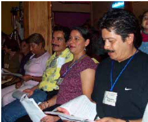
Some of the attendees

In April 2002 we held our first board meetings in Mexico. During the first CGO meeting we discussed the possibility of holding a retreat for the Southern area of Mexico. A testimony was shared about a small retreat of