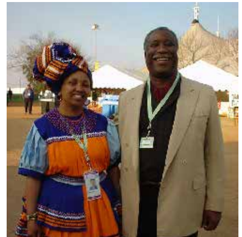
Leyland with woman in African dress