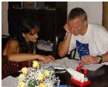
A CVC class

I recently made a CVC presentation at a JT camp in Romania and wanted to testify that more teens are being turned on