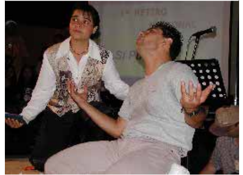
Performing the "box skit"

punch. Then the band led us in a fun dance. We enjoyed sweet fun and fellowship with one another, giving our Active members a glimpse into another aspect of our lives—the free spirit we enjoy in our precious Family where we can let our hair down a bit and enjoy it. We have a happy God!