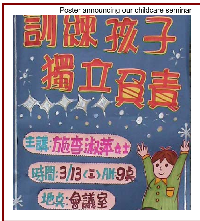
Poster announcing our childcare seminar