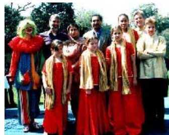
"Dosti," our performing team, with the governor and his wife

As we had come straight from the governor's house, we still had all our equipment and outfits in the van, so the kids got up and performed for these people too. After the show the organizer of the party got up and explained our work and asked everyone to donate something. Totally unexpected! The Lord supplied a little over US$400 that day. PTL! We had just moved houses, which had cleaned us out financially, so had been desperately praying for the Lord's supply. What a miracle and answer to prayer!