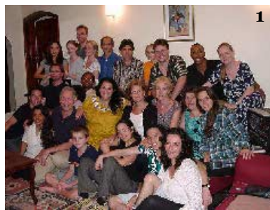
African board meeting pictures

The idea is that format of the meetings won't be to just pass on information, but more to have discussions about finding new ways to inspire the JETTs/teens and help them grow, and at the same time the J/T Board members will share what they've been learning about the need to uphold the standard laid out in the Word and have more conviction when shepherding the young people.