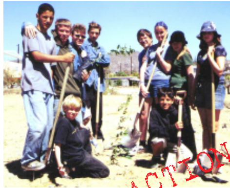
This group of teens just finished planting hundreds of small trees in a poor community in Mexico, some of which are lined up in a row behind them.

After choosing four Mexican states in which to concentrate our efforts, a couple of exploratory trips were made to contact the