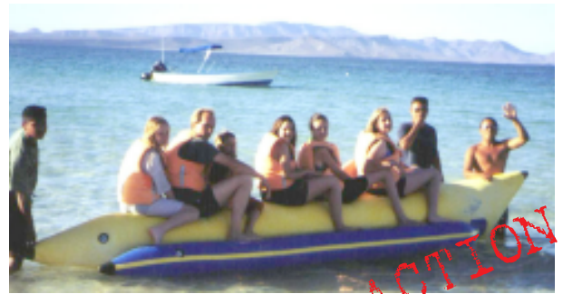
March 2000. After the CTP work was done the teens took a fun ride on the "banana boat" in the bay of La Paz, Baja California, Mexico. It was wet and wild. We camped at this beach.

If you've been around teens you know that most Family teens like action with a capital "A." They like to have fun, excitement, adventure, challenge, go to new places, see new faces and often it's because they just want to be active. Isn't that the way most of us feel?