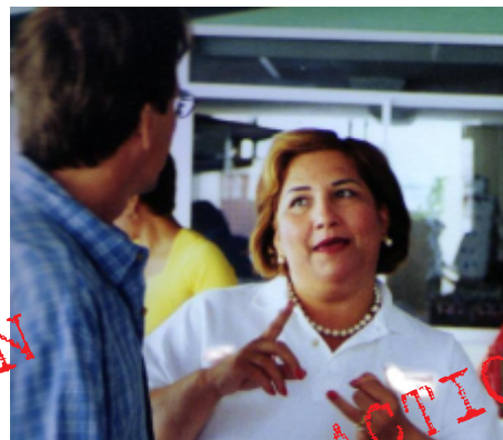
Ado discussing with a government official the plans of our next CTP project.

horses on the beach, climbing mountains, kayaking, camping, swimming, eating delicious provisioned meals, bathing in cold rivers, exploring remote areas, playing soccer and basketball, etc. Our accommodations have been anything from a tent or a trailer to a luxury hotel, even sleeping on a deserted beach under the stars and listening to the ocean waves or sleeping out in the open in the mountains around a campfire and next to a family of indigenous people.