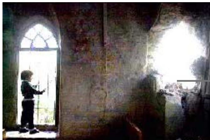
A large hole marks the spot where a tank shell hit this home in the West Bank town of Beit Jalla.

We want to thank our wonderful worldwide Family for upholding the work in Kosovo in your prayers! We really love and appreciate you, as we proceed together into 2001 and the "Era of Action"!