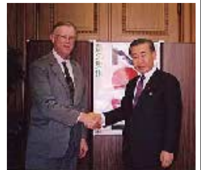
●Meeting former Japanese premier

"Looking back in the past we can see that the 20 th century was the time of wars, a time of development of technology and