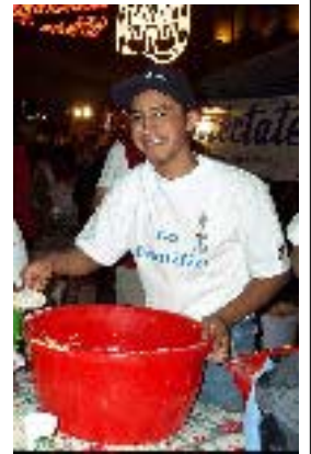
●Feeding the multitudes