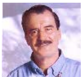
● President Fox

C hristmas Zocalo CTP, volcano explosions, encounter with President Fox, Mexican Army joins the Lord's Army for CTP! Read how this exciting combination of events were fused together by God's fiery Spirit on the eve of 2001 to produce a hot Latin Christmas.—A true, live, missionary adventure that will never be forgotten.