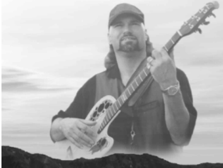
With attractive jacket & interactive songbook. Also included on the CD is a video track featuring song "Outlaw". Contact Hungarian PPC at hpc@libertas.hu or visit our web site: www.libertas.hu