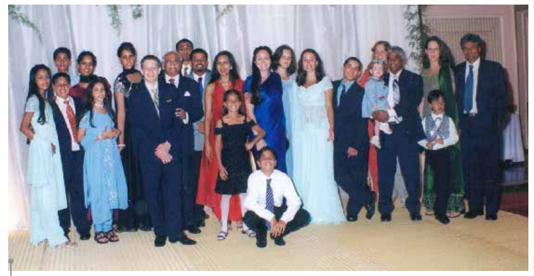
Here is our Home at the wedding of a friend, in 2002.

quite a while. But even if you have to wait a very long time, don't get discouraged or give up. I have found that efforts to see these top people are well worth the wait. Your patience and persistence will be rewarded.