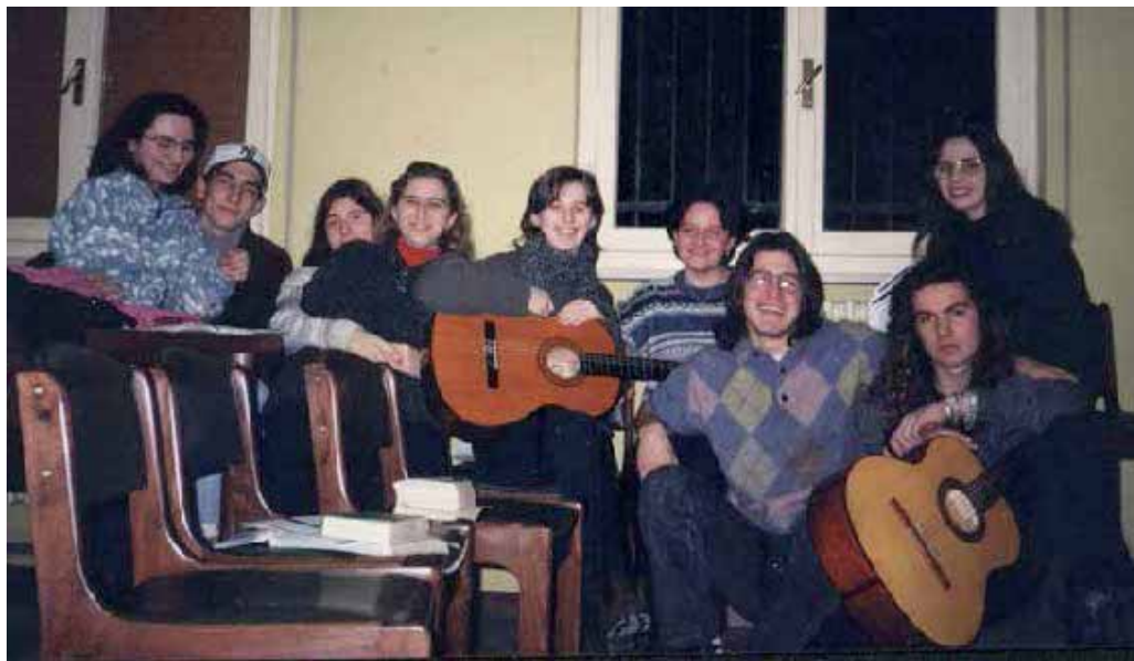
With a group of young people after a prayer meeting during my time in civil service (December 1995)

I was witnessing full time and I had a lot of fun, even though being alone with nobody to pray and