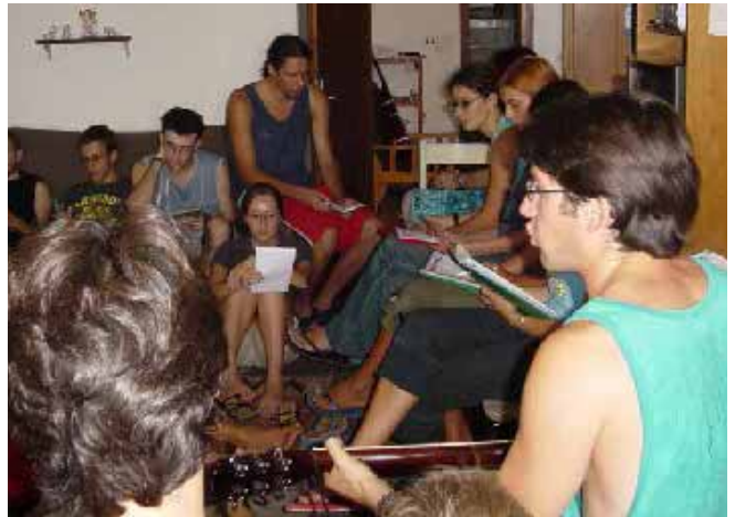
Devotions with visitors during summer camps in Rijeka (August 2003)

A lot of people were interested in the Lord, I found, and so I began giving Bible classes to the most receptive ones. I was supposed to work six or seven hours a day, but I was basically there the whole day, helping and witnessing. At times I did extra jobs for the workers in order to be able to stay