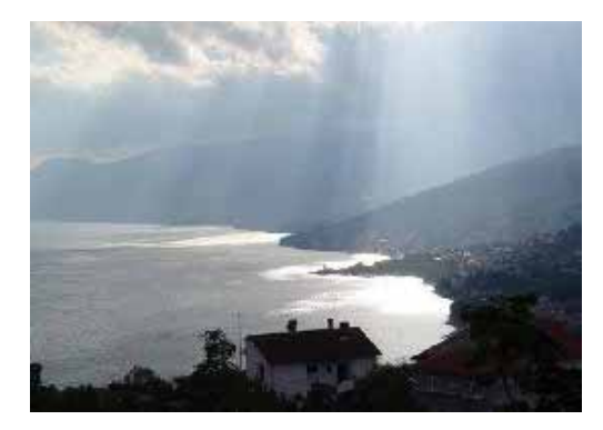
The view from our Home

Many people in our Home have prayer lists by their beds with the names of their sheep.