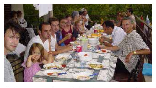
Dining together after an Activated meeting at our Home

Before visitors come, we usually pray about what to do with them, and of course what we do varies depending on the type and length of their stay. For bigger numbers and for those staying longer, we try to have a few people involved, as it's quite a job.