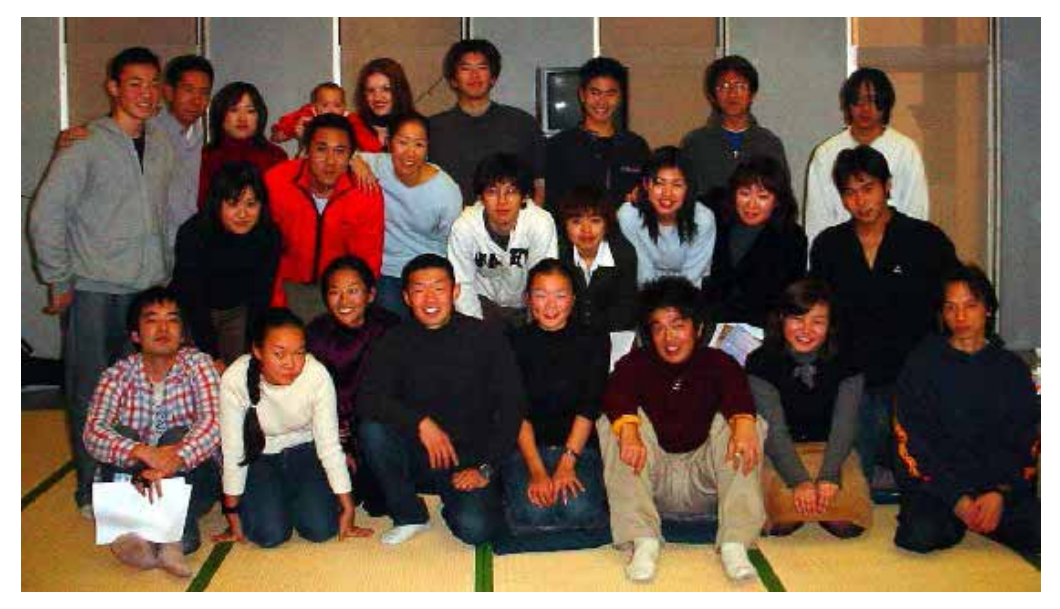
The True Colors Christmas party for university students, organized by the Blade and the MP3 Homes, with dinner, games, stories, and table discussions

They invite these university students to the large seminars they hold, where many of them get saved. The seminars have been on topics like "How to be Happy Anyhow," and "Peace" (in