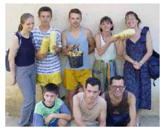
Visiting some refugees with friends from Italy

In the beginning everyone was experimenting, for example, with various methods of keeping addresses, or with what kinds of activities would