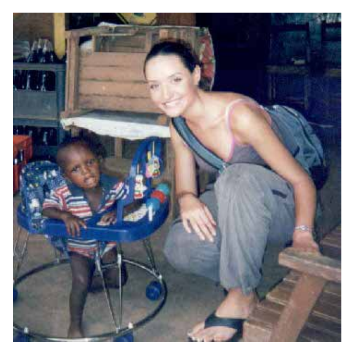
Faith in Africa

During her visit, unbeknownst to me she dropped off some books, which seemed to me to then "mysteriously" turn up on my bookshelf. A selection of Heaven's Library books. The one that caught my interest was Betrayal , so I skimmed over the back where it explained how the text was received in prophecy as told by