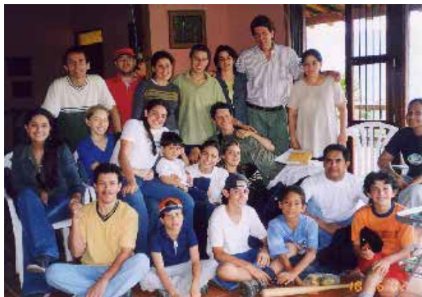
Our Active members and a few of us